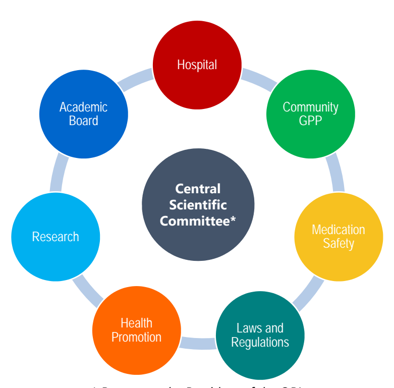
* Reports to the President of the OPL

For details and names of all members: <a href="http://opl.org.lb/newdesign/scientific committee.php">http://opl.org.lb/newdesign/scientific committee.php</a>